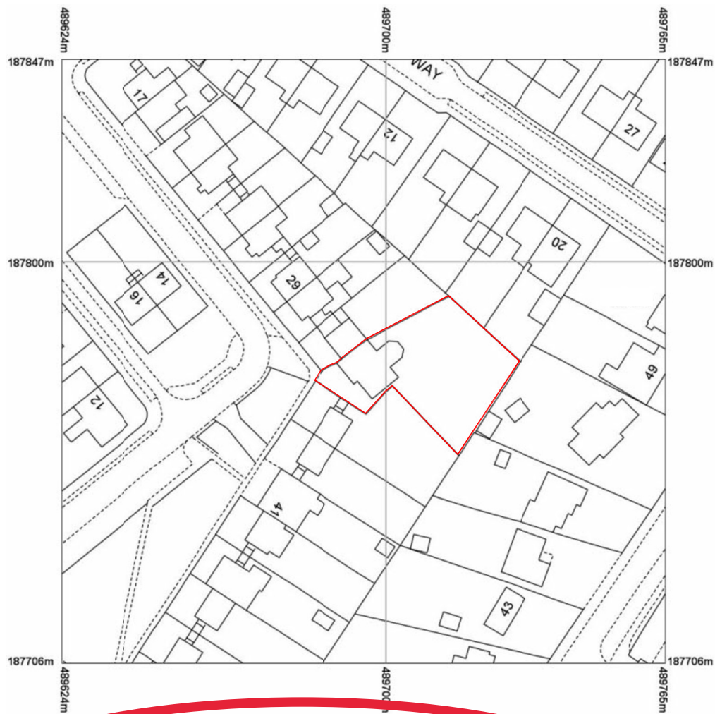
Site Location Plan 1:1250