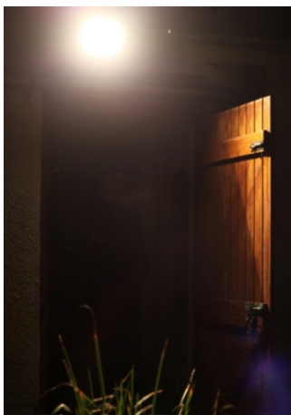
Light angled correctly Light angled incorrectly

Make sure your light shines only where needed: a light angled downwards can be more effective than one angled outwards.