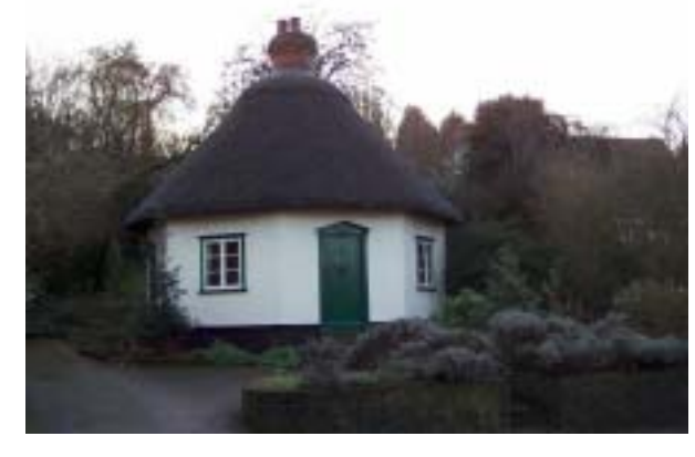
The Dutch Cottage

3.4% for England and Wales and 8% for Essex.