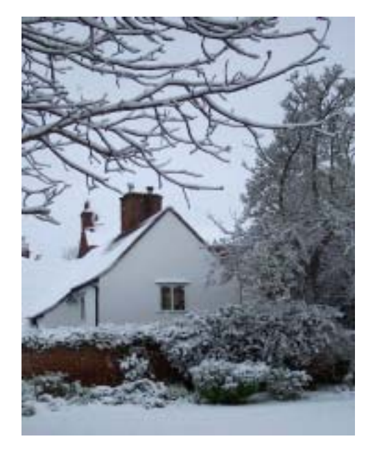
Rochford District Council building

Tel: 01702 536366 Fax: 01702 545737 www.rochford.gov.uk