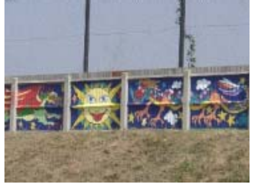
St Mark's Community Mural

Lack of cultural facilities in the district was also highlighted, including no specific museum or live music and performance focused space, as well as a frustration regarding the lack of cohesive communication about all opportunities in the district.