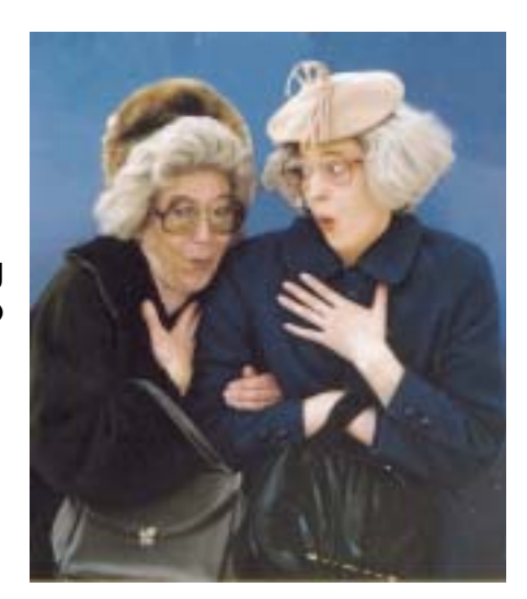
Time of Our Lives Theatre