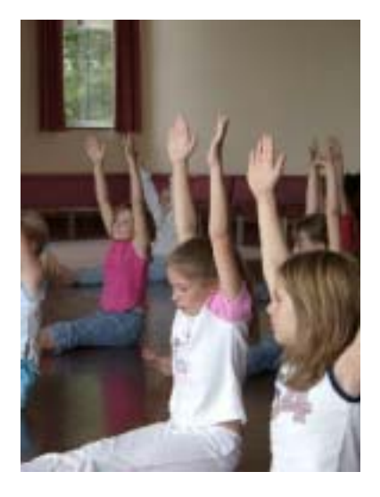
Dance holiday activity

There is a desire to develop and promote activities for the under 8 age group, with Council's and schools requesting that activities/initiatives fit in with the curriculum.