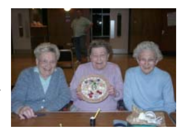
Rayleigh Physically handicapped Group

The Arts Council England East has also developed a document, stating its priorities for the future and the importance of local partnerships. "The arts are central to local economies in design, manufacturing, retail and leisure services. The arts make all the difference to how we feel, and the quality of our lives; participation can improve physical health as well as mental well being. The arts help us express our different cultures and ideas and enables us to communicate with others."