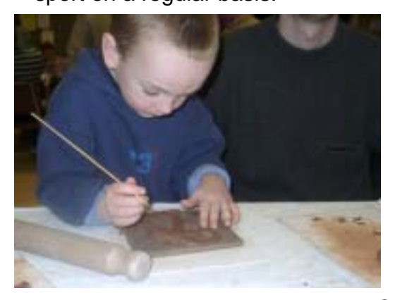
Family Discovery Day