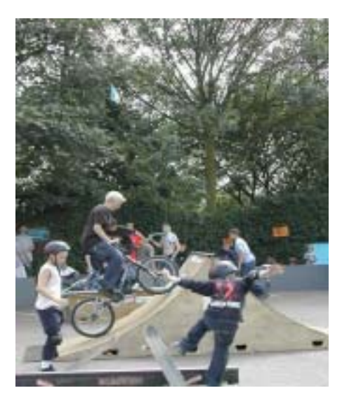
Mobile Skate Park

Rochford District is not working alone to promote cultural activity. All local authorities have been encouraged to develop their own strategies, as well as regional level organisations.