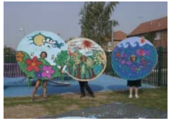
St Mark's Community Art Project

The document sets out the aspirations of the County in terms of promotion of culture and its benefits, as well as promotion of Essex as a cultural county.