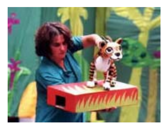
Tiger Child by Tam Tam Theatre Company part of the Essex On Tour scheme

Rochford has substantial areas of natural beauty and a wealth of local heritage, local architecture, unique folklore and its substantial range of woodland areas. Through cultural activity, this uniqueness can be promoted and used as a tool to benefit the local population economically, socially and environmentally. Some of the projects we have developed include the Rubbish Riot,