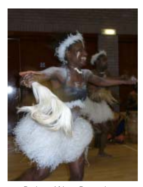
Brekete African Drumming and dance part of the Essex On Tour