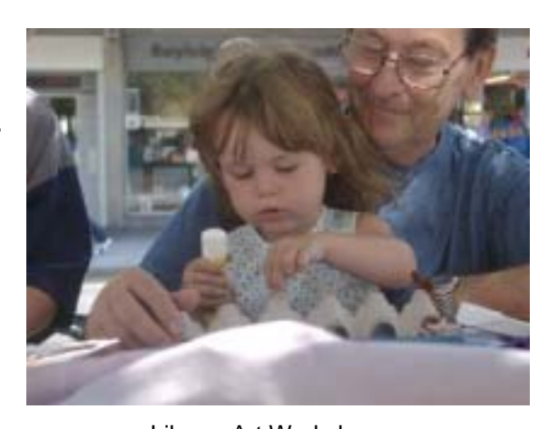
Library Art Workshops

For this particular strategy, we have been consulting, investigating and communicating with departments, businesses, organisations,